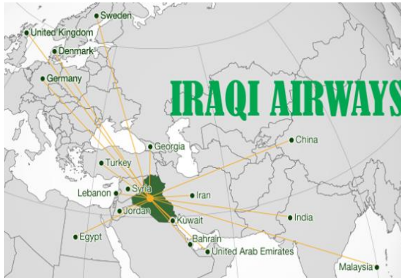
Figure 3 - Iraqi Airways destinations.