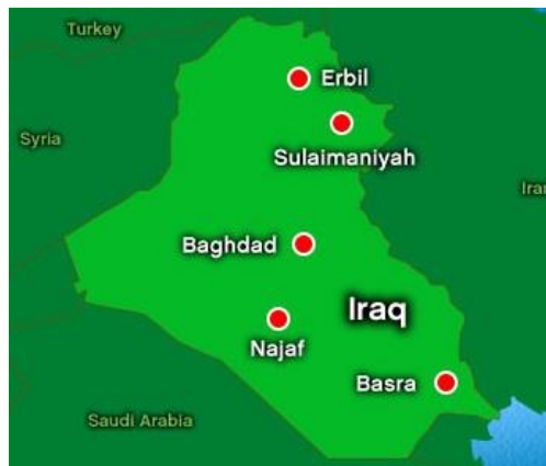
Figure 2 - The Iraq main airports.

In Fig.2 we can see the location of these airports in Iraq map.