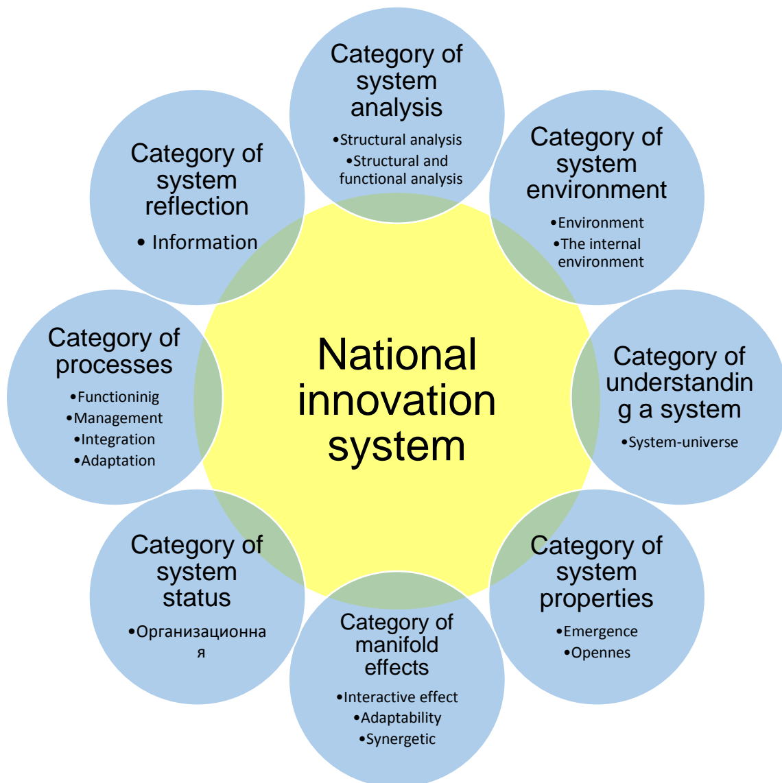
Fig.2. The national innovation system in the classification of the categories of systematic approach.

The key challenge in all countries is to accelerate the technological development of the global economy, increasing competition for the factors that determine the competitiveness of national innovation systems. Based on this, the aim is to increase the level of innovation activity of the economy. Currently, due to the reduction of the period of realization of scientific innovations to entrepreneurs/enterprises, it is necessary to quickly respond to changing national and international needs. Rapid response can only provide a temporary advantage, as it can be used, copied, imitated by competitors in both domestic and foreign markets. Innovation activity - the most flexible indicator of status and competitiveness of the national economy.