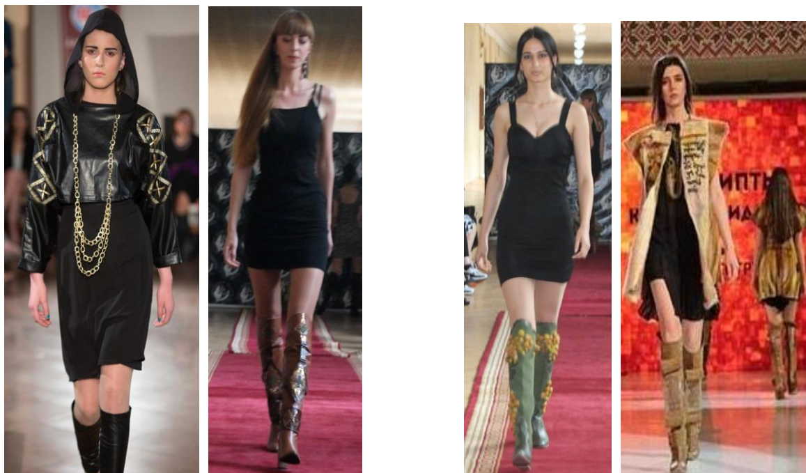
Fig. 1. The fragments from show of footwear and clothing created with national motives.