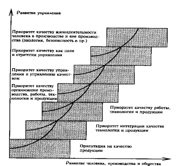
Figure 2 - The quality of work and product quality: the interdependence of tendencies

Achieving quality requires a certain cost. The value of the quality of the cost - the most important characteristic that reflects the quality of management. But the cost of quality is not yet characterize the potential to achieve quality. Costs can be very high, but lower quality because the costs not always have immediate and direct impact. They sometimes serve only the sequence of formation of quality building, such as the qualification of the cost of employees, production infrastructure. [2]