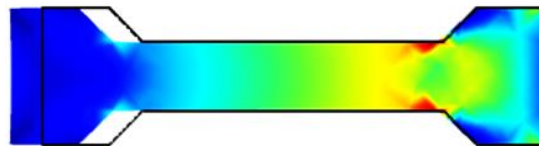
Figure 1 – The deformed state of the flat specimen model.

where \nabla \cdot FS is divergence of the 1 st Piola-Kirchhoff stress; F is the deformation gradient; S is the 2 nd Piola-Kirchhoff stress; F_v is the body load.