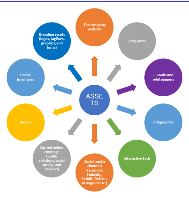
Figure 1. Digital marketing assets