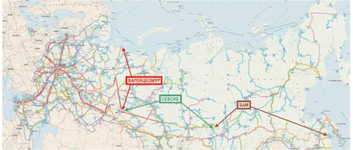
Fig. 1. General scheme and components of the North-Russian Eurasian railway