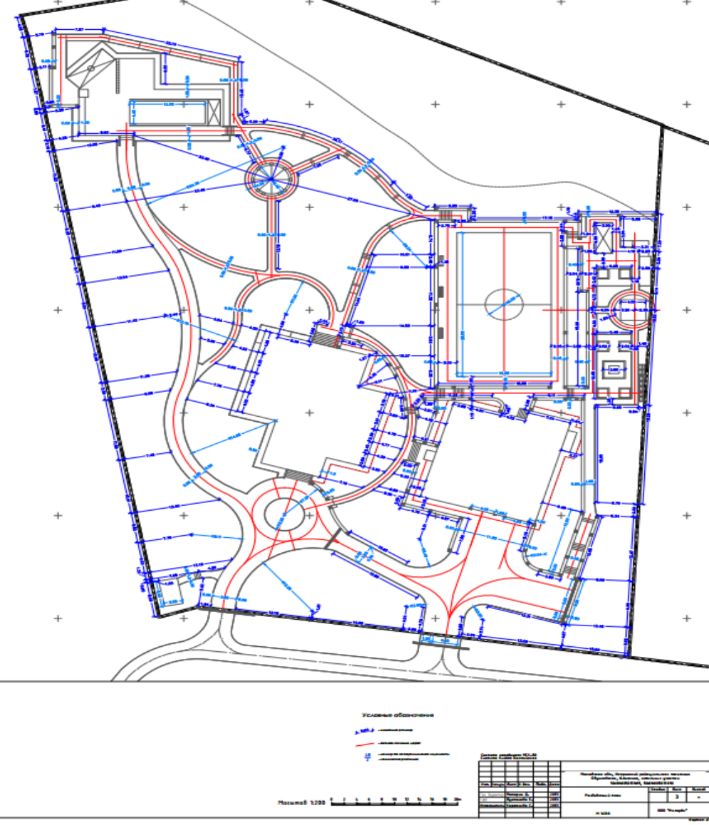
2 photos of the drawing of landscape design

Planned errors are given to students from lectures on topographic drawing and landscape design with errors and omissions in preliminary demo drawings. Finding and analyzing drawings that match the design, activate the creative thinking of students, increase their attention and arouse interest in solving an existing problem.