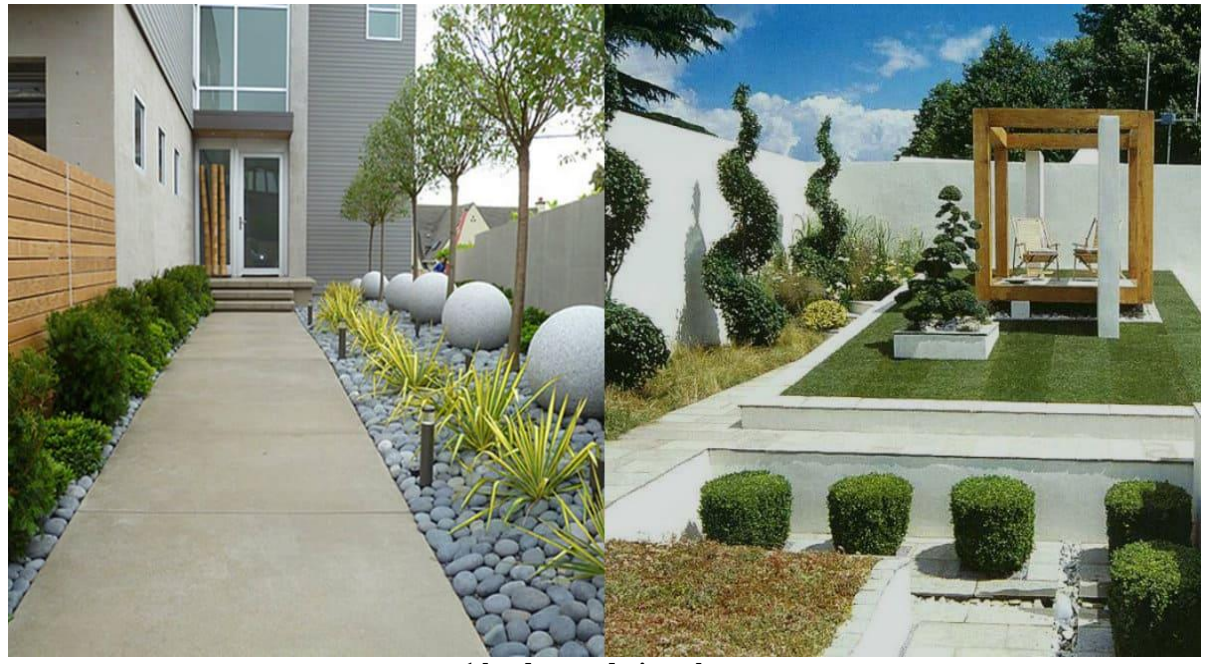
1 landscape design photo

In our time, landscape design is very developed. Landscaping is based on the science of topographic drawing and the science of engineering graphics.